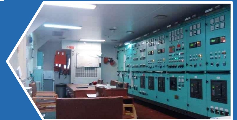
ENGINE ROOM RESOURCE MANAGEMENT