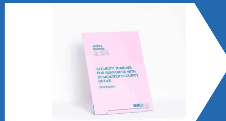
IMO MODEL COURSES OF SEAFARERS TRAINING