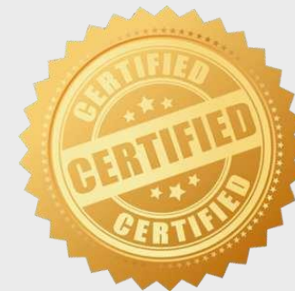
GENERAL OPERATOR'S CERTIFICATE (GOC) FOR GMDSS